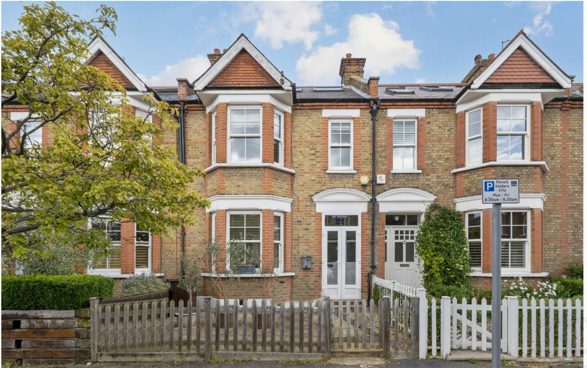
Kenwyn Road, West Wimbledon, SW20 8TR