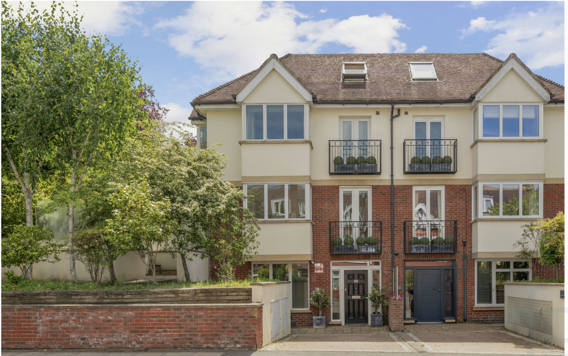
Home Park Road, London, SW19 7HS