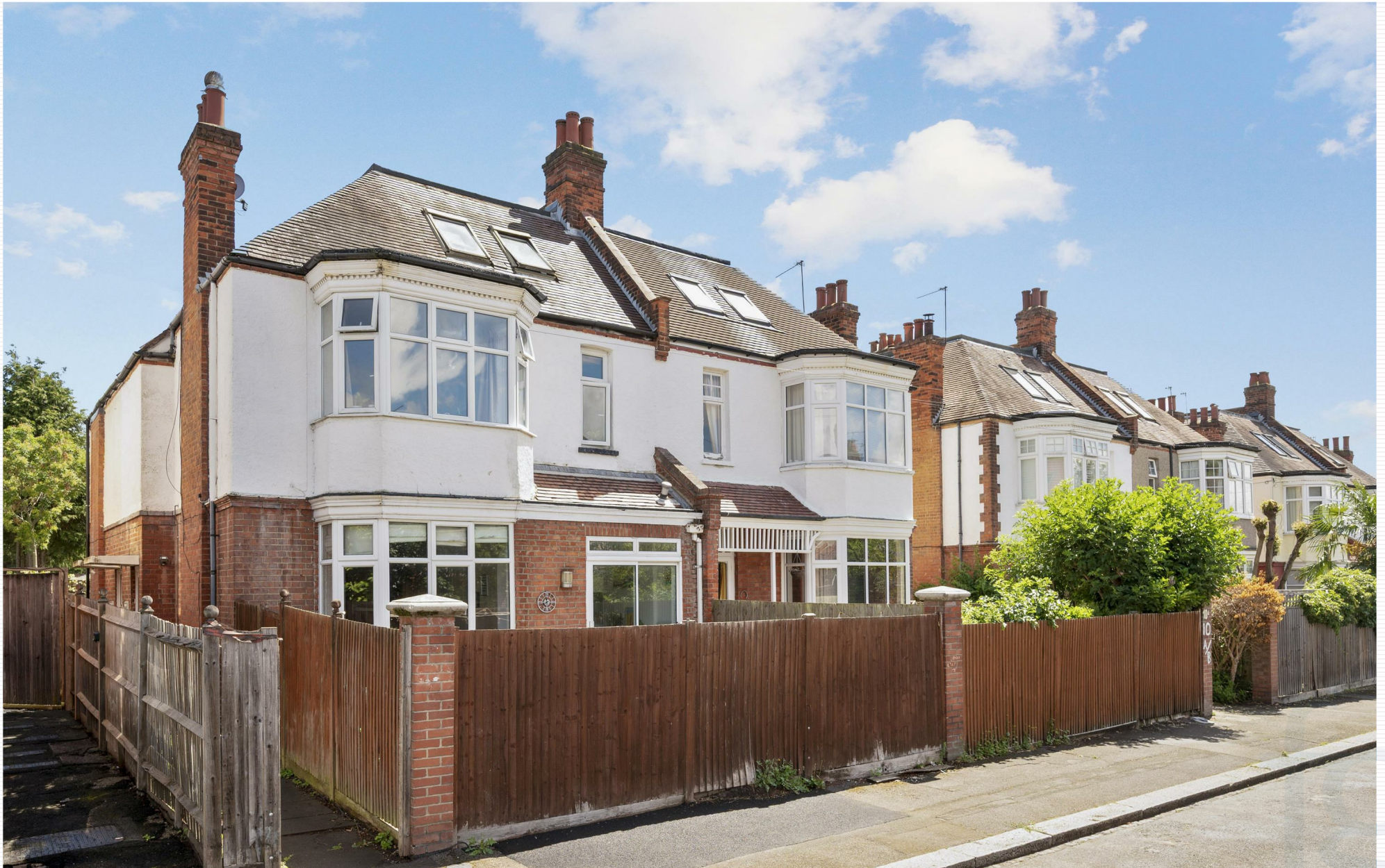
Laurel Road, West Wimbledon, SW20 0PR