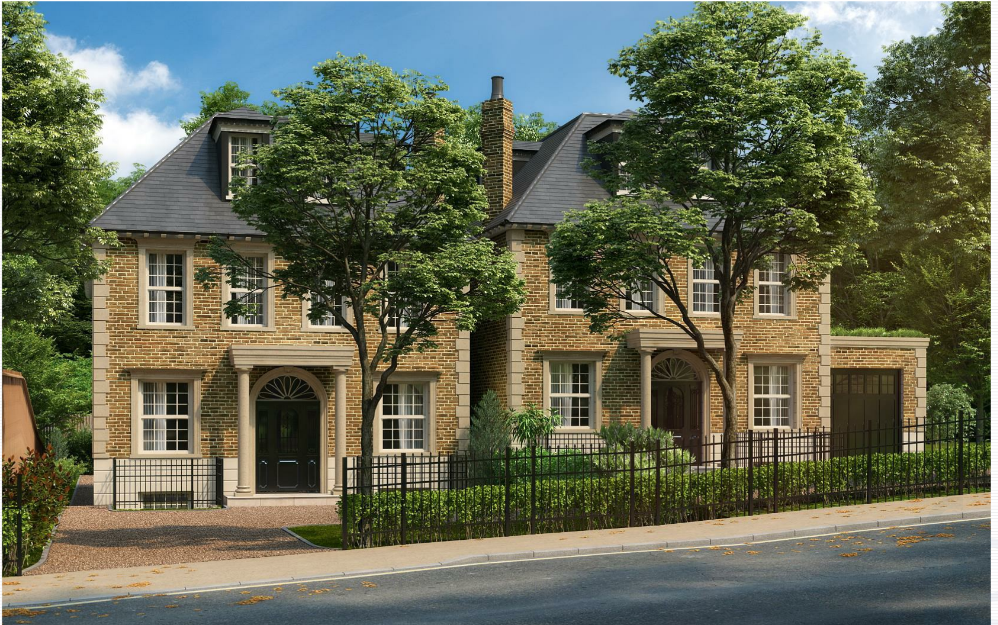
Arterberry Road, Wimbledon, SW20 8AF