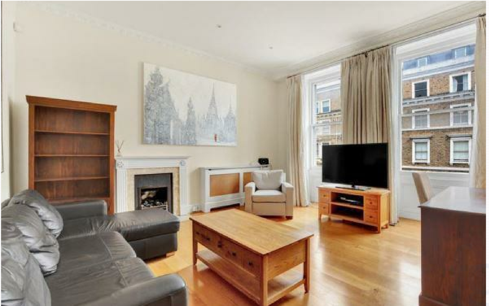
Queen's Gate Place, South Kensington, SW7 5NU