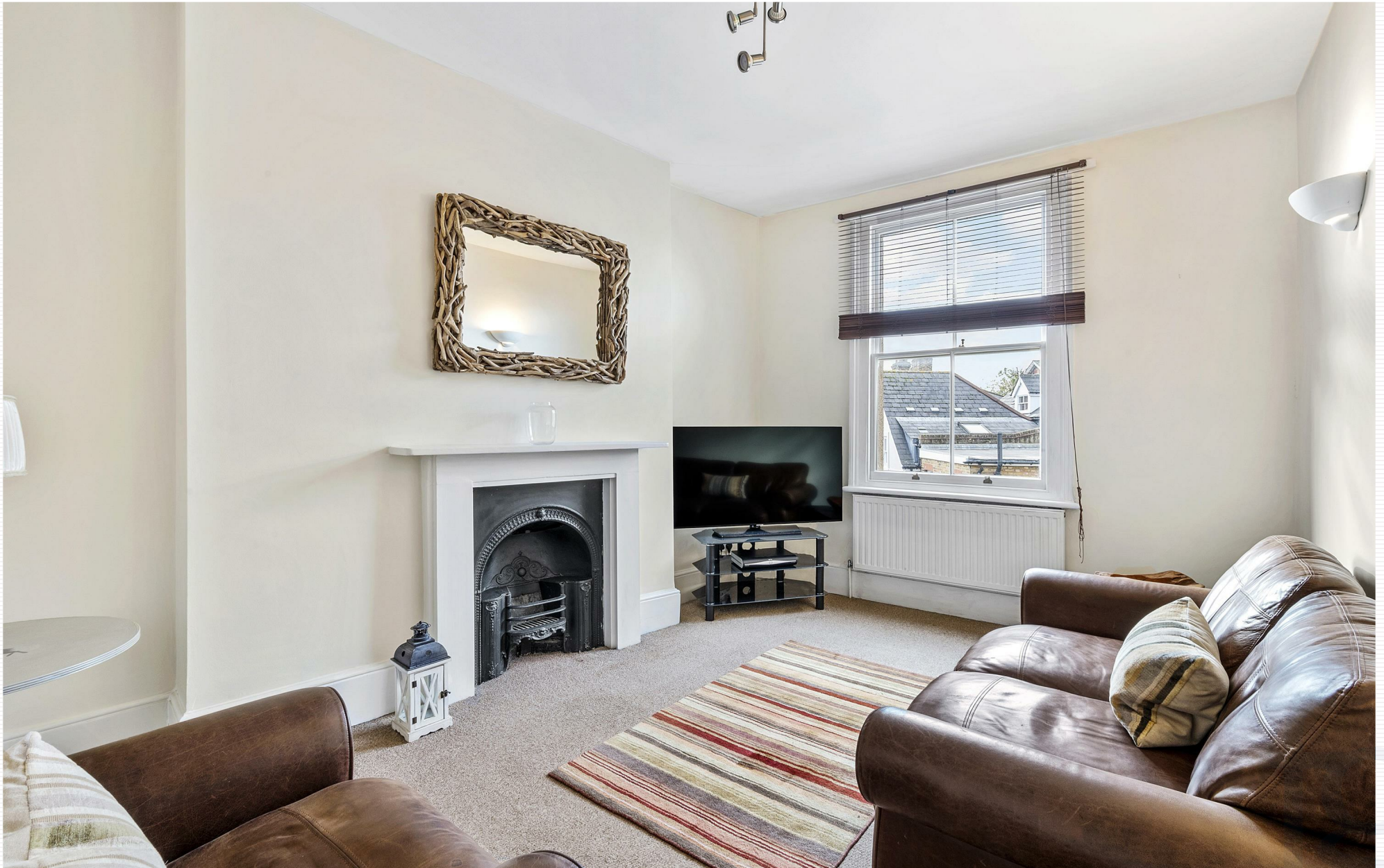
High Street, Wimbledon Village, SW19 5DX