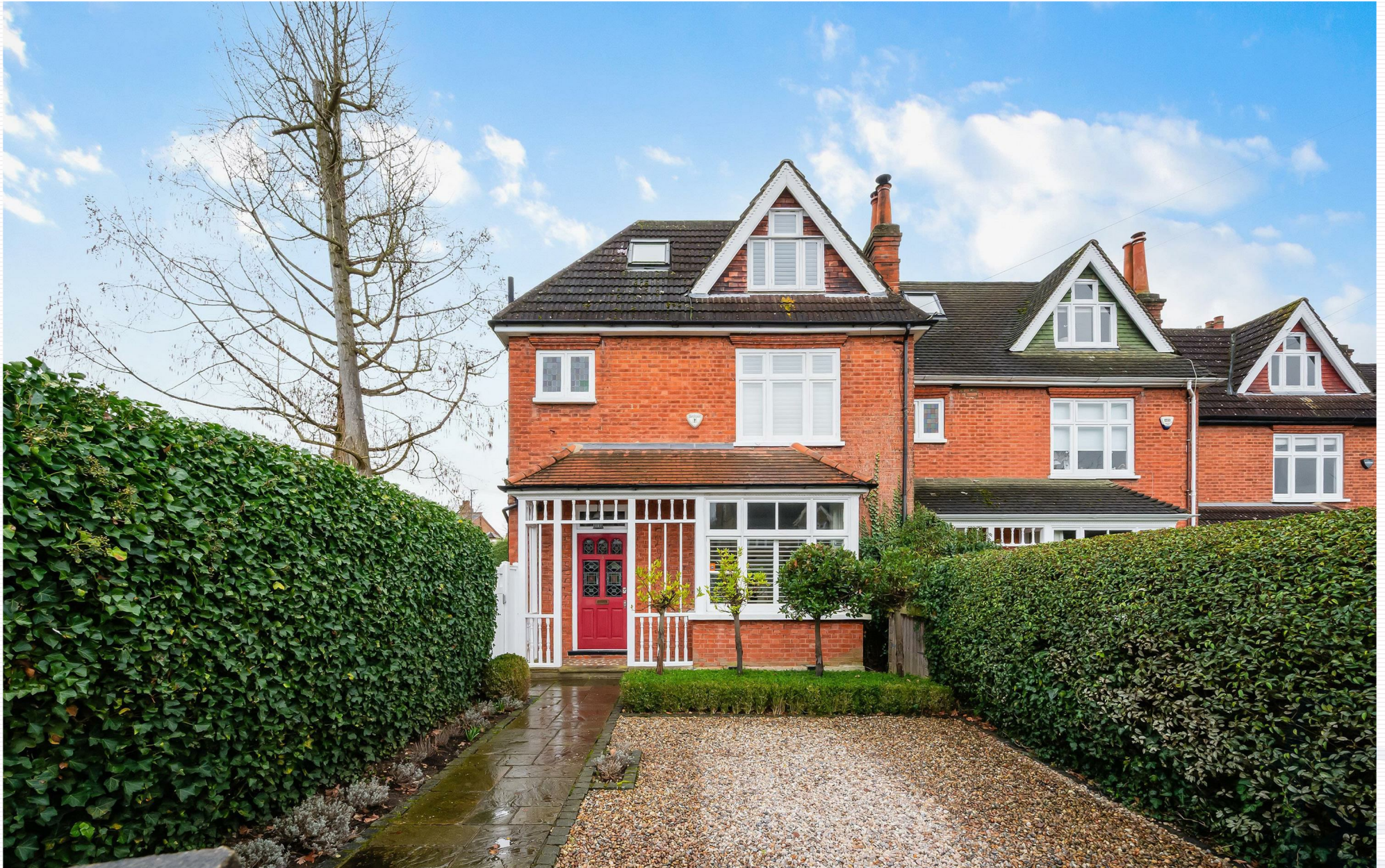
Cambridge Road, West Wimbledon, SW20 0SQ