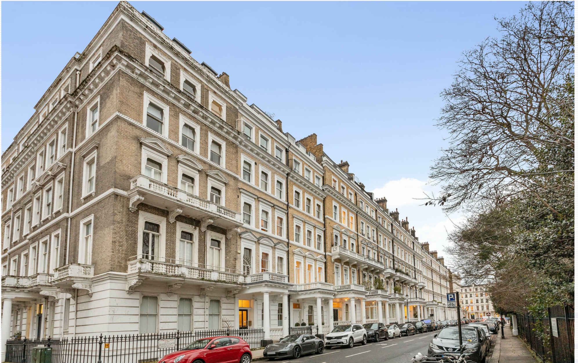
Queen's Gate Gardens, London, SW7 5RP

Guide Price £1,200,000 Share of Freehold