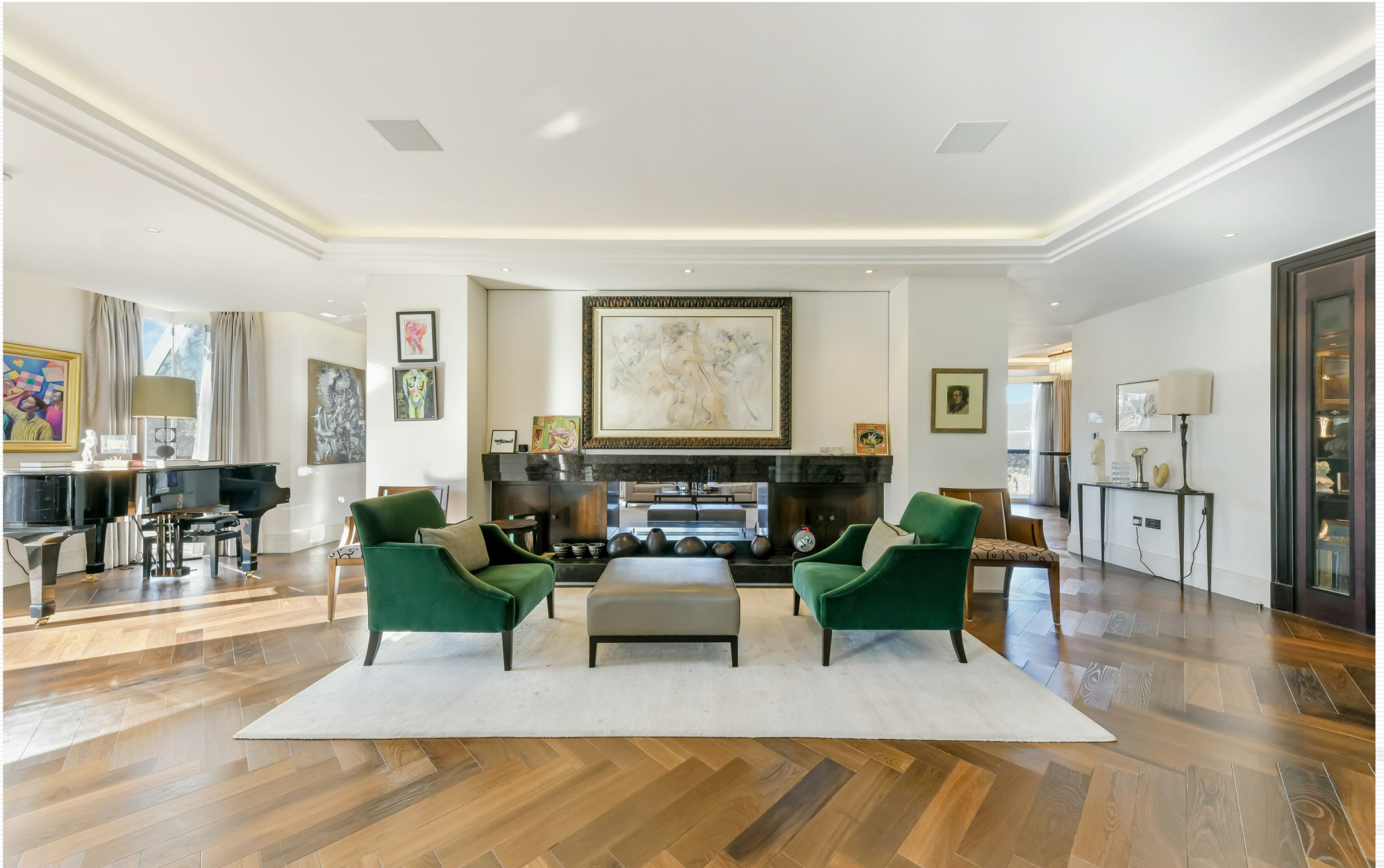
Strand, Westminster, WC2R 1AB