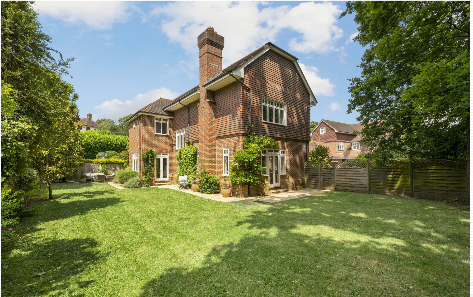
Bathgate Road, Wimbledon, SW19 5PW