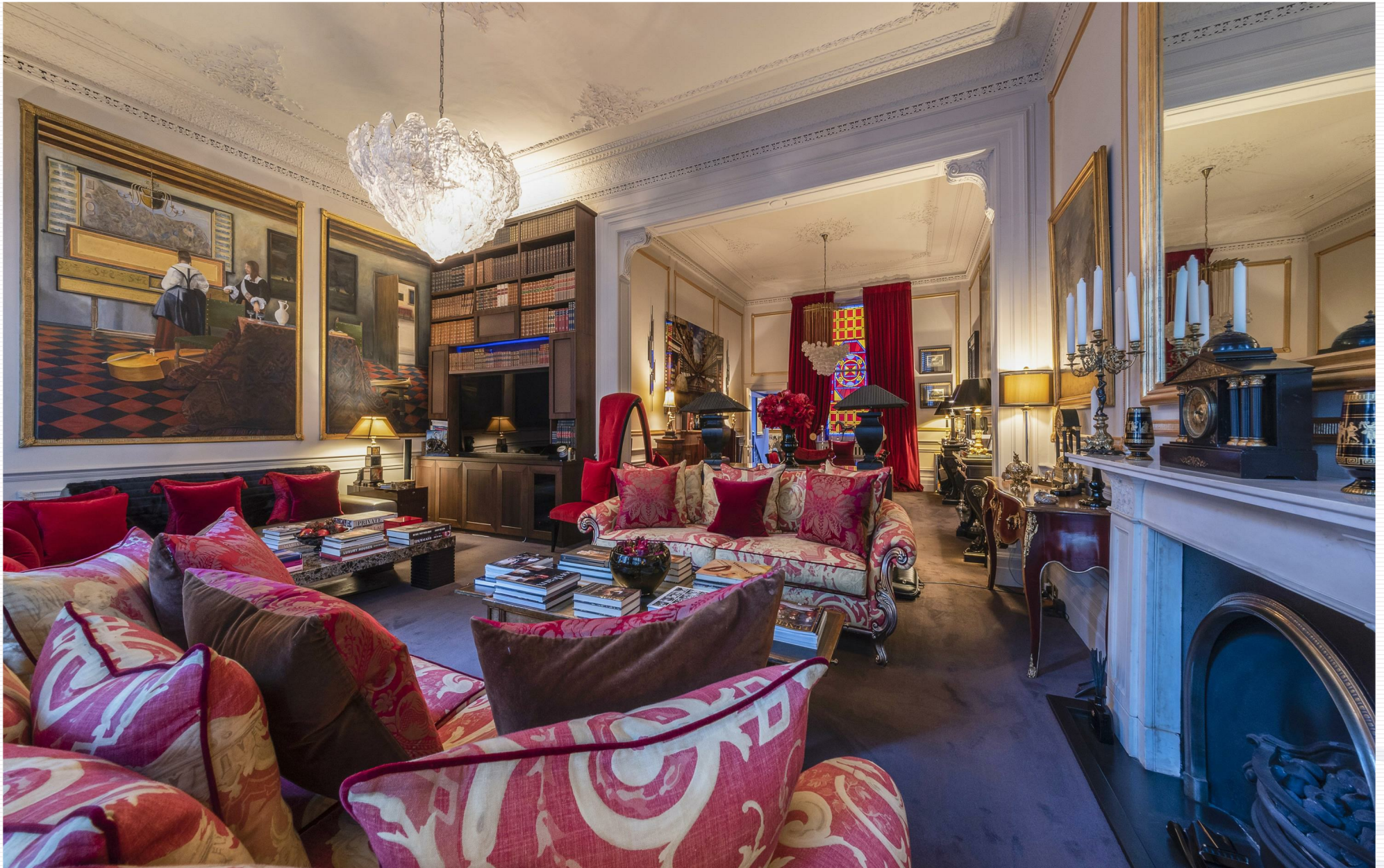
Palace Gate, Kensington, W8 5LS