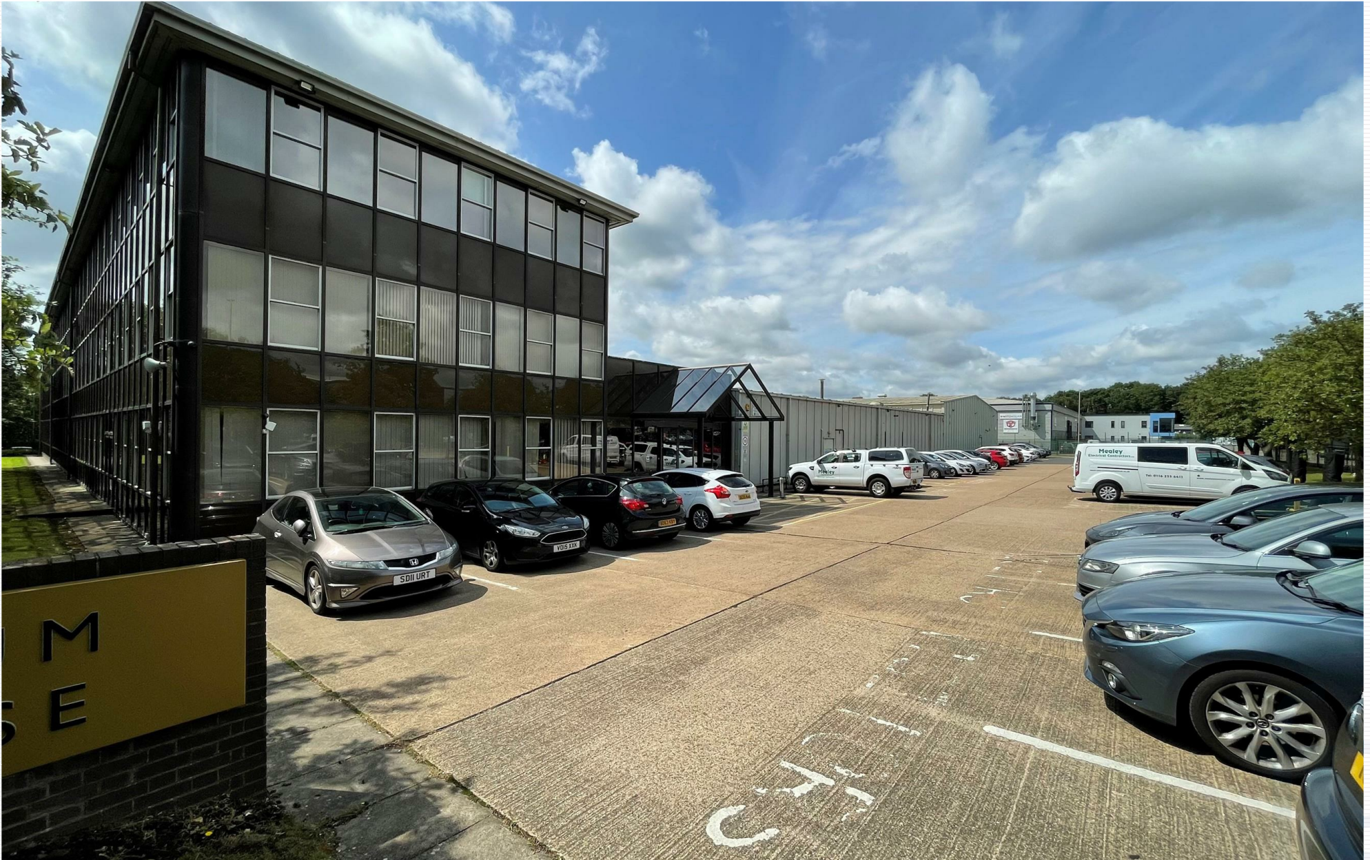
Aurum House, Elland Road, Braunstone, Leicester, LE3 1TT