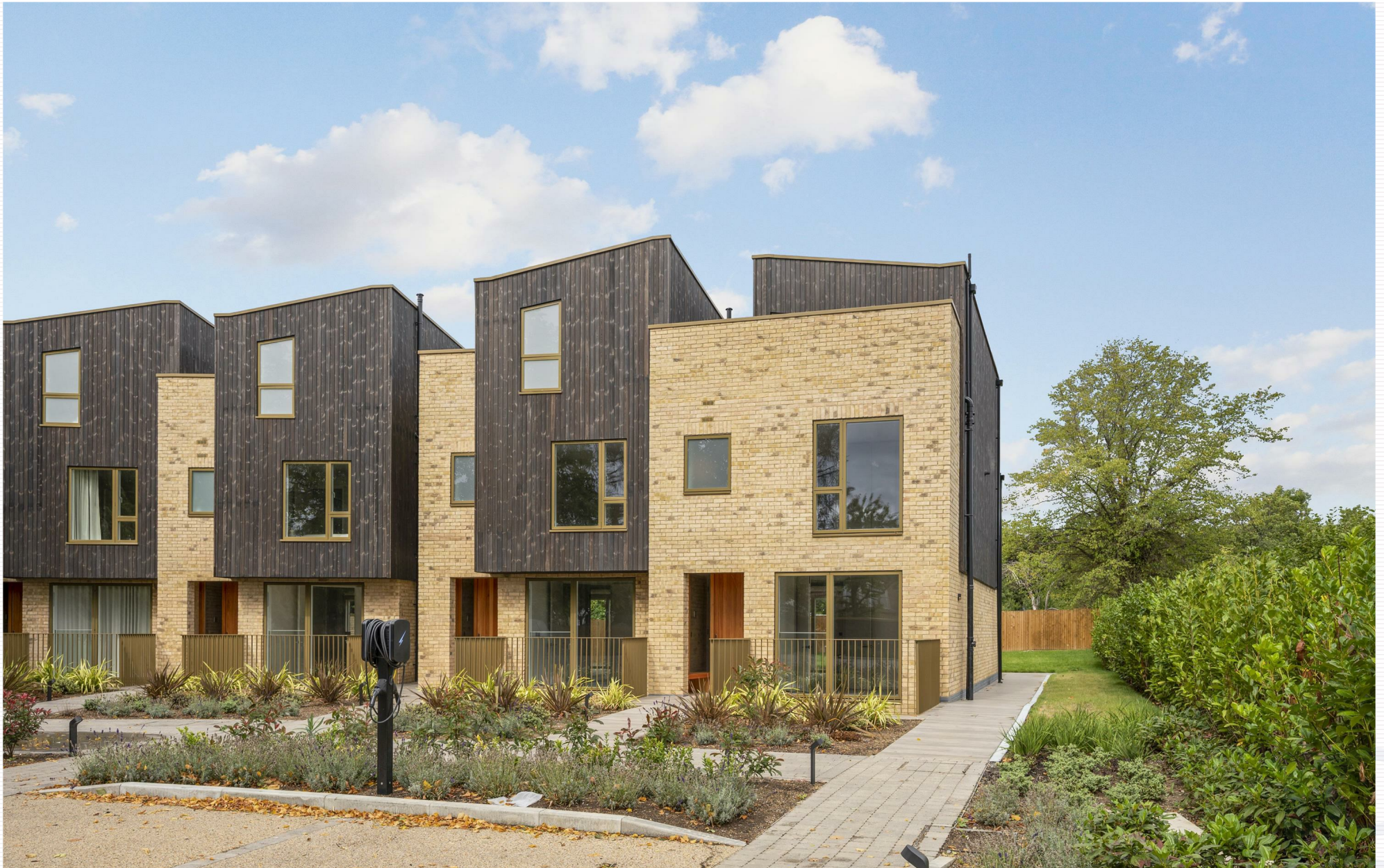
Coombe Lane, West Wimbledon, SW20 0RW