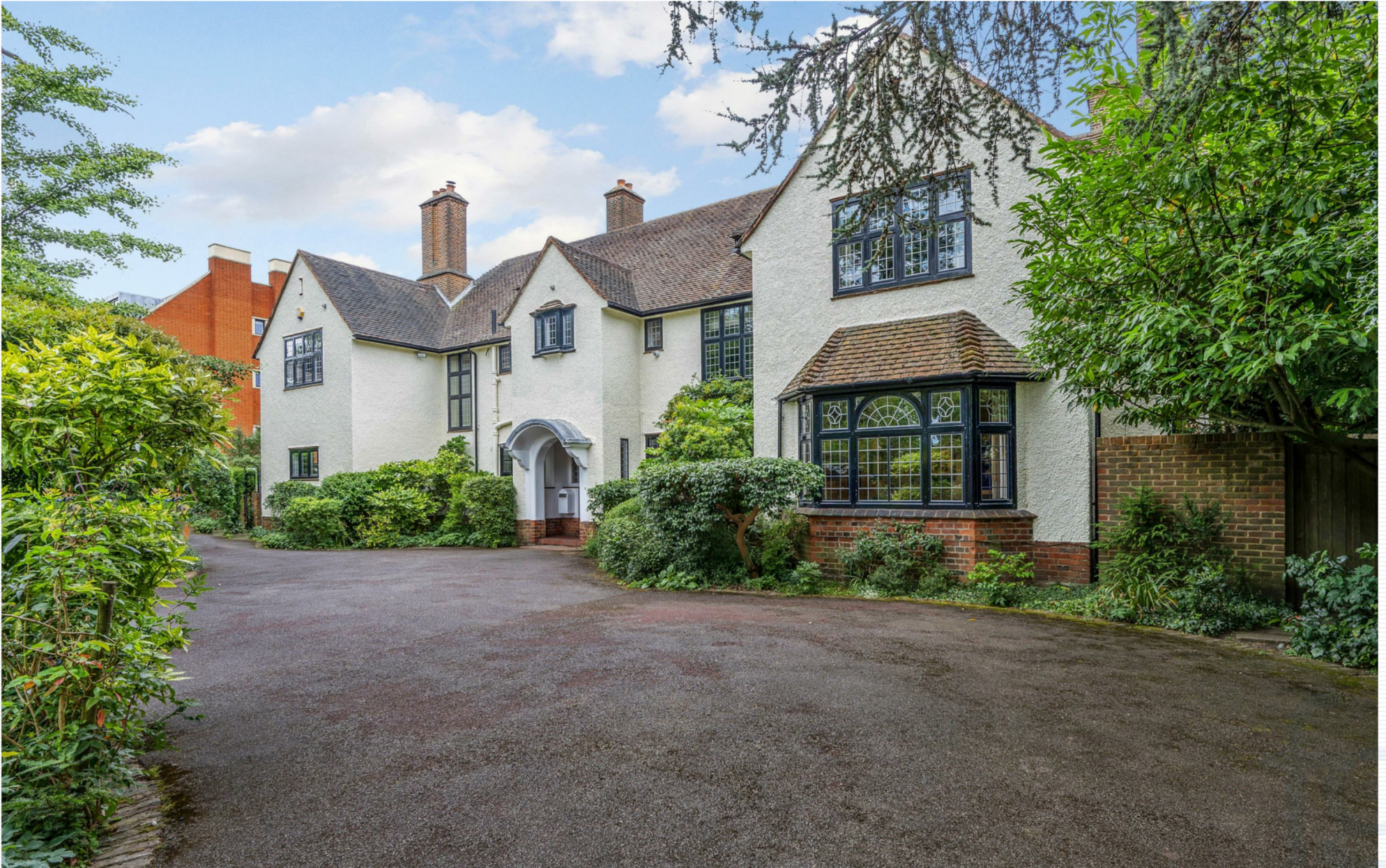
Southside Common, Wimbledon Village, SW19 4TG