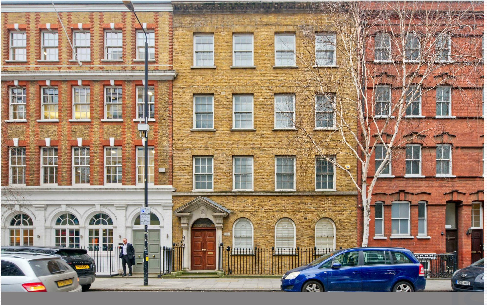
Leman Street, Whitechapel, E1 8EU