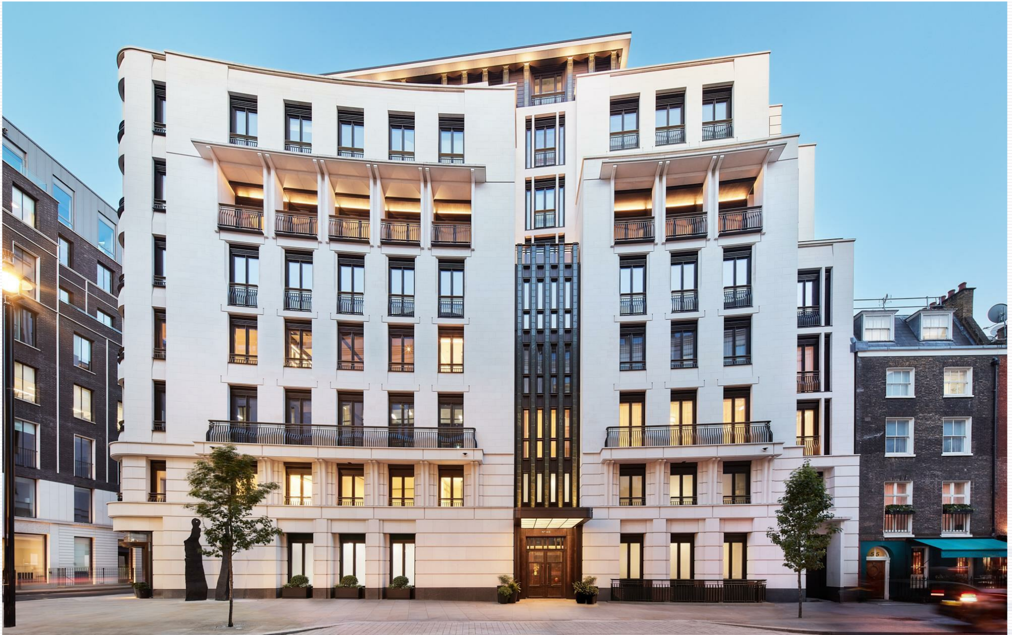
One Bedroom Apartment, Mayfair, W1J 8PD

Guide Price £4,350,000 Share of Freehold