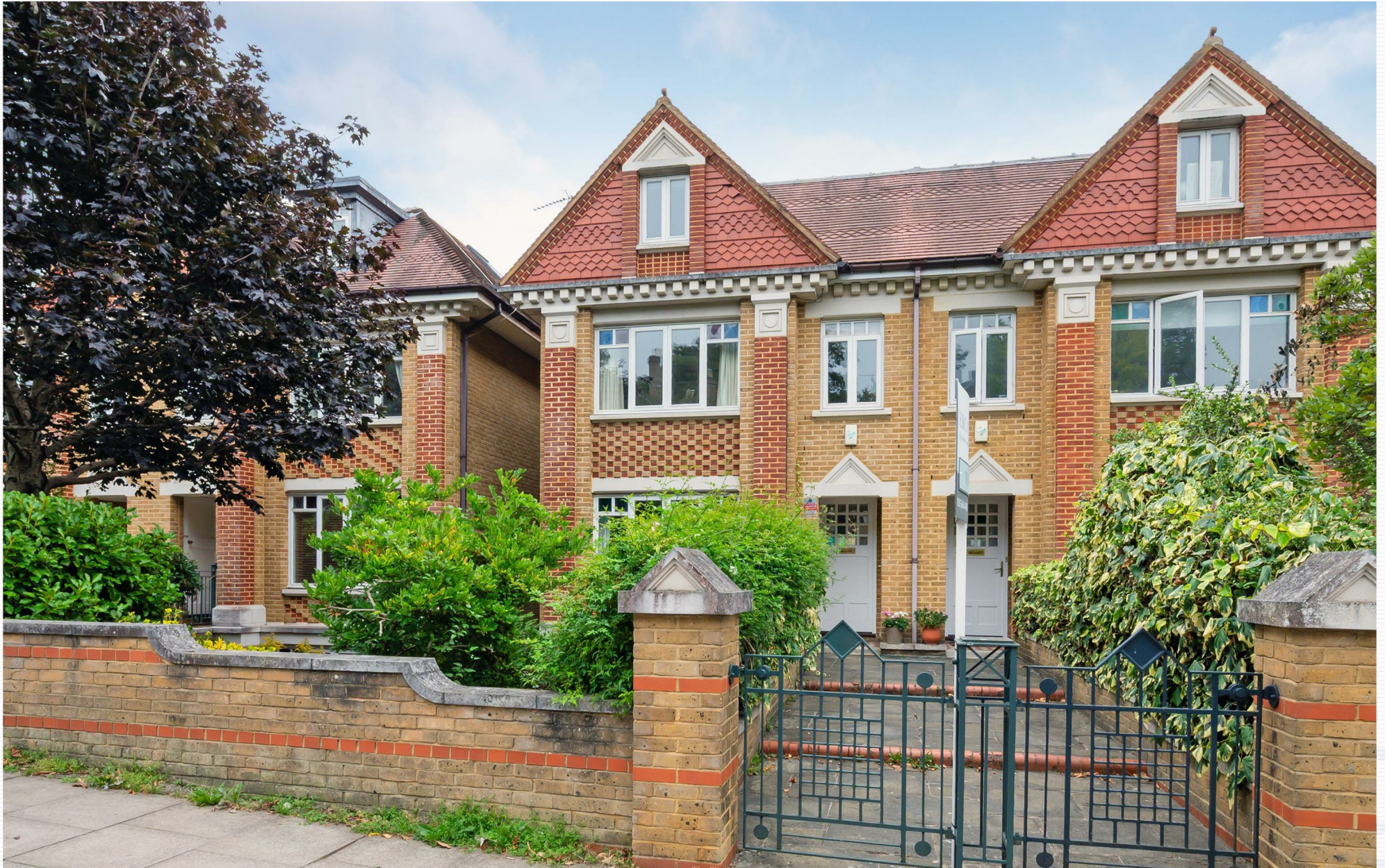
Cottenham Park Road, West Wimbledon, SW20 0SB