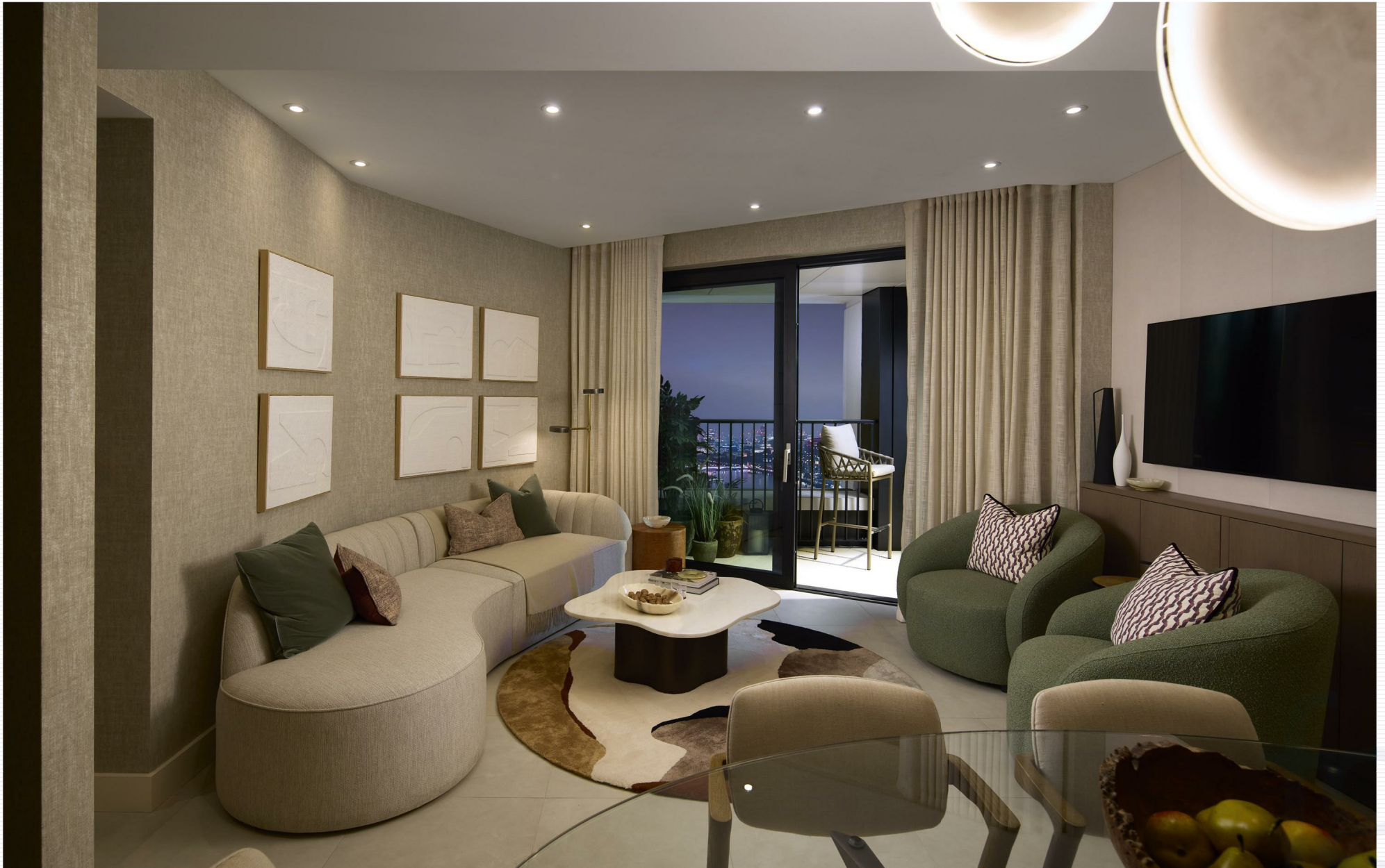
Three Bedroom Apartments, Ascenta, Nine Elms, SW11