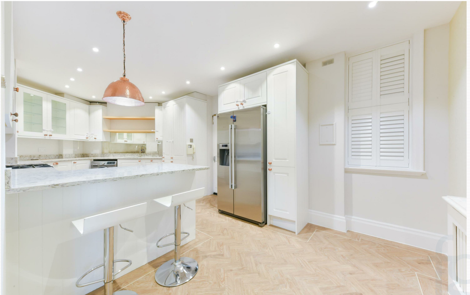
Onslow Square, South Kensington, SW7 3HU