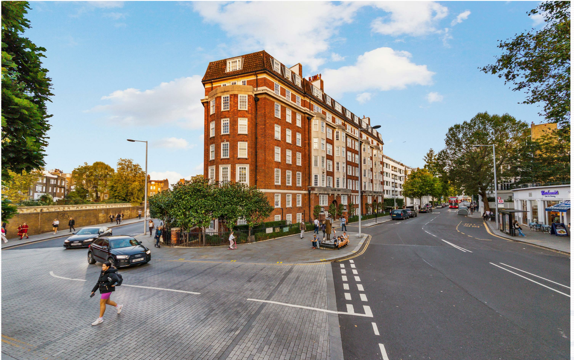
Malvern Court, Onslow Square, London, SW7 3HY