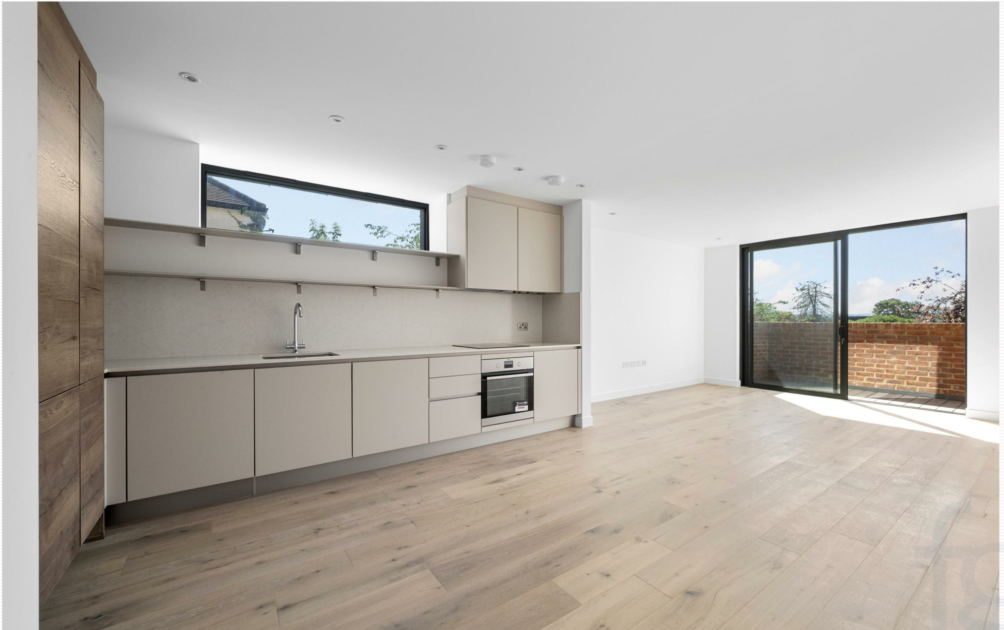
Cottenham Park Road, Wimbledon, SW20 0SB