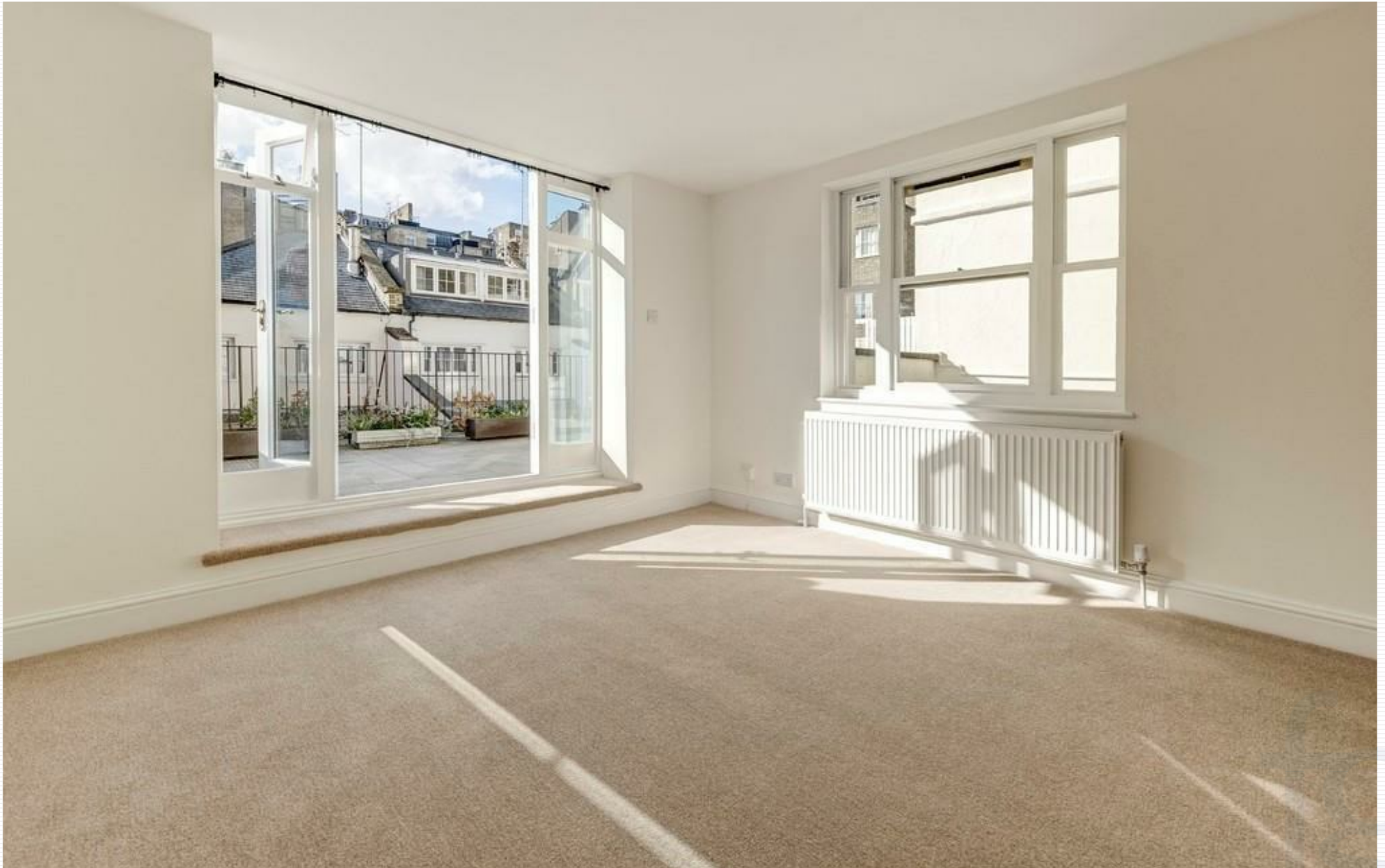
Queen's Gate, South Kensington, SW7 5JN