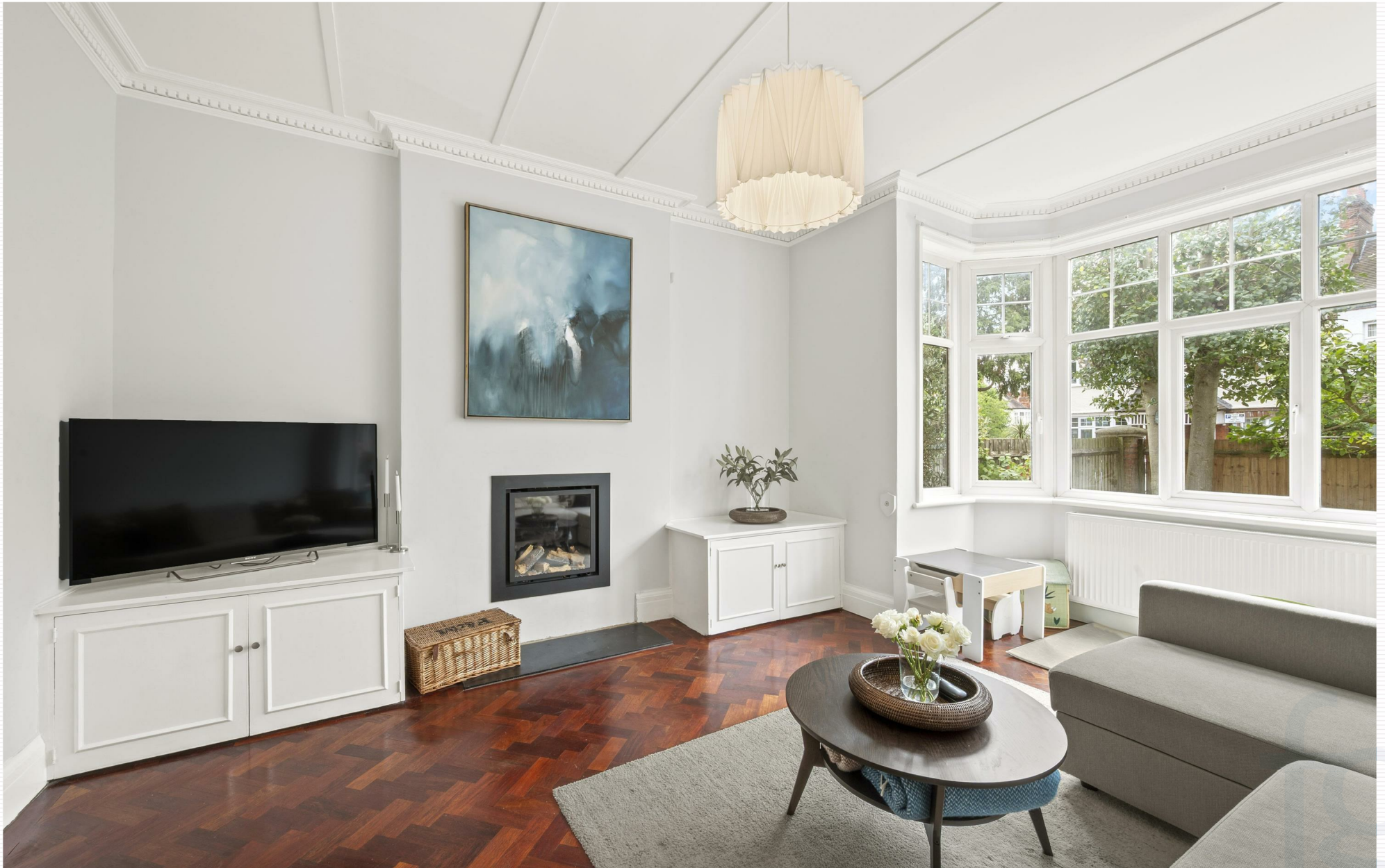
Melbury Gardens, West Wimbledon, London, SW20 0DN