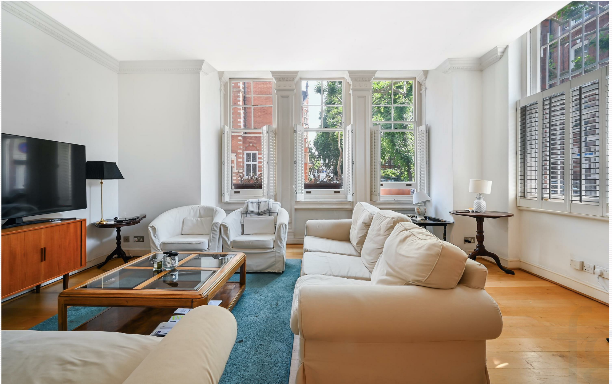
Collingham Gardens, Earls Court, SW5 0HL