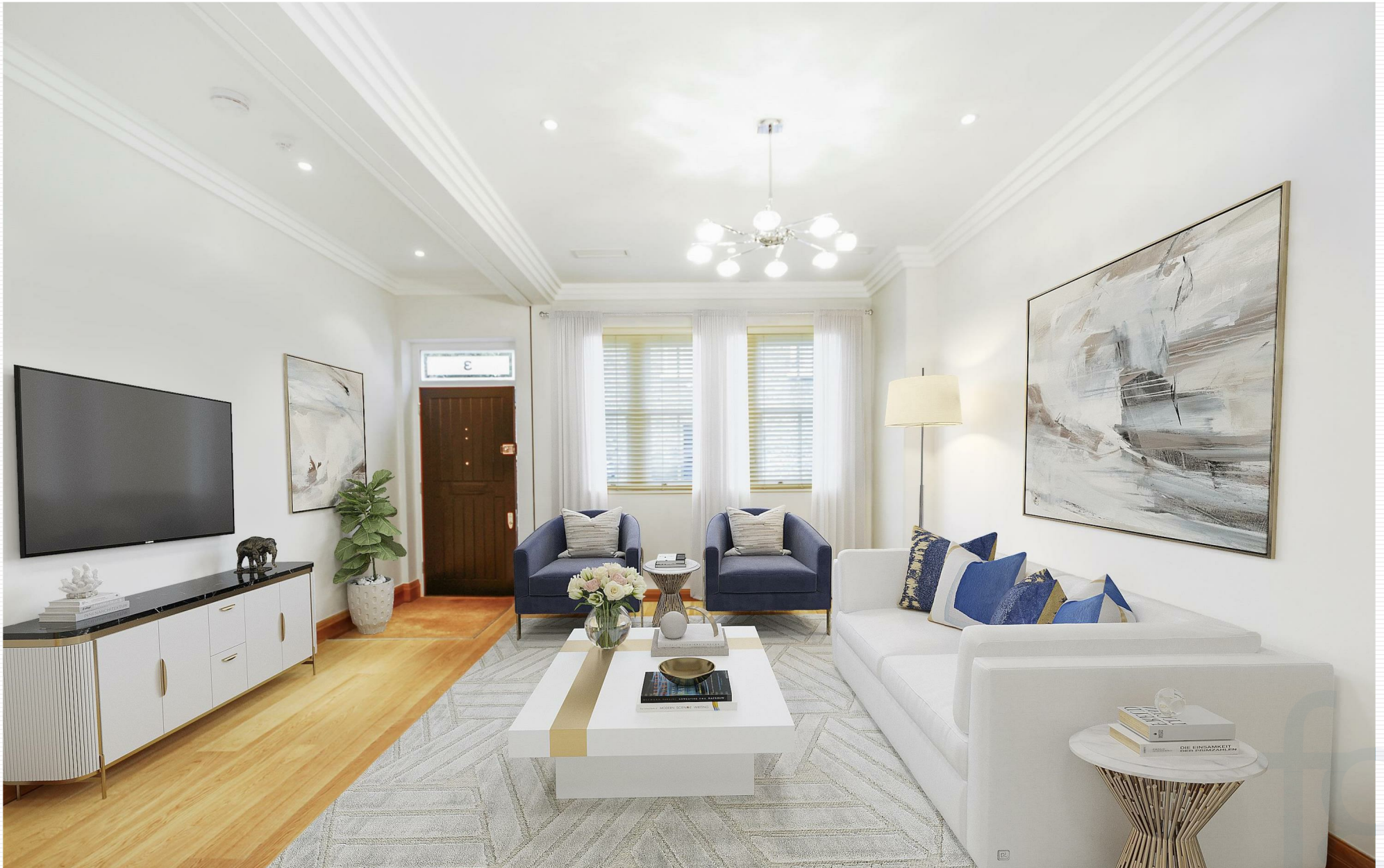
Queen's Gate Mews, South Kensington, SW7 5QJ