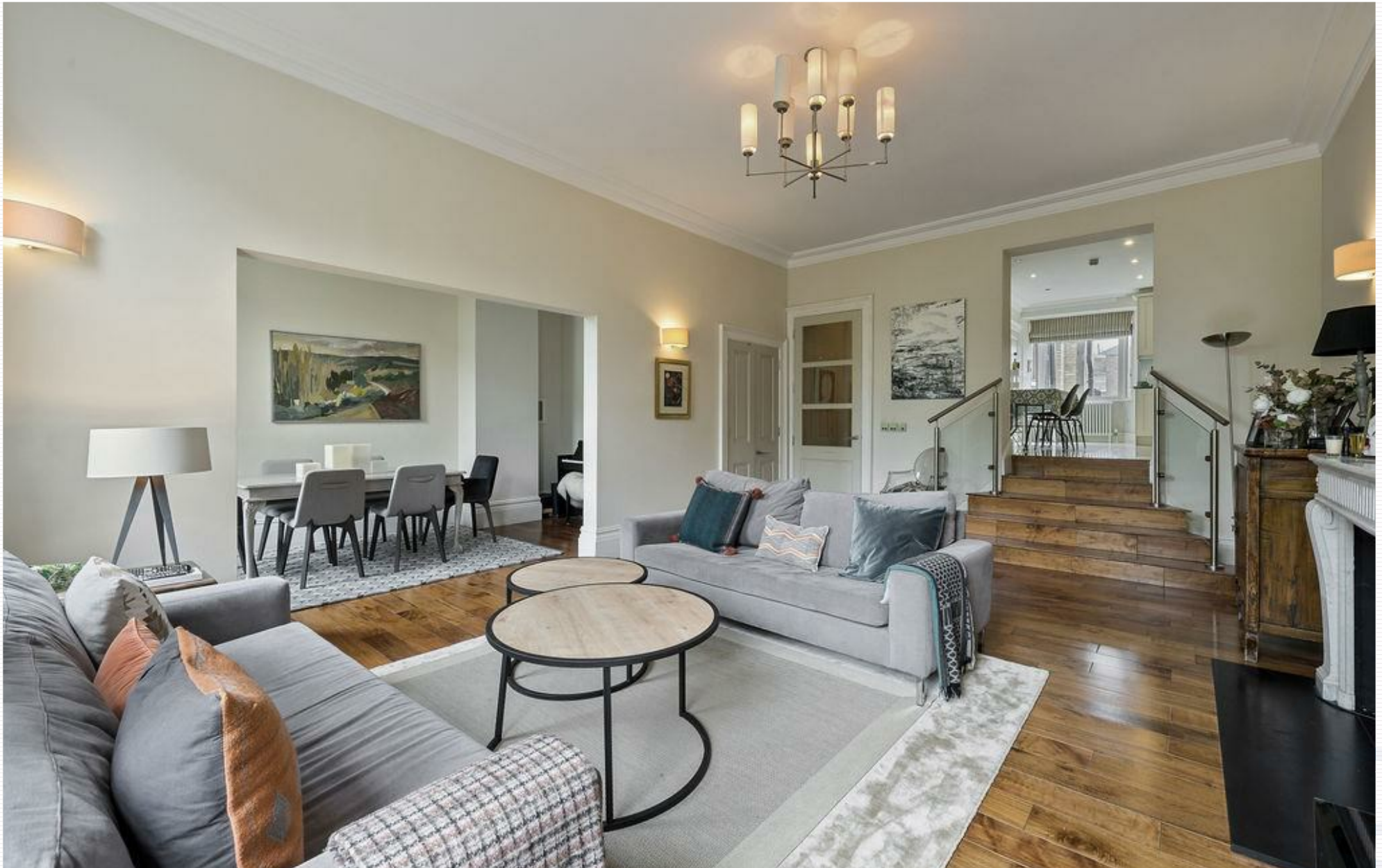
Queen's Gate Gardens, South Kensington, SW7 5ND