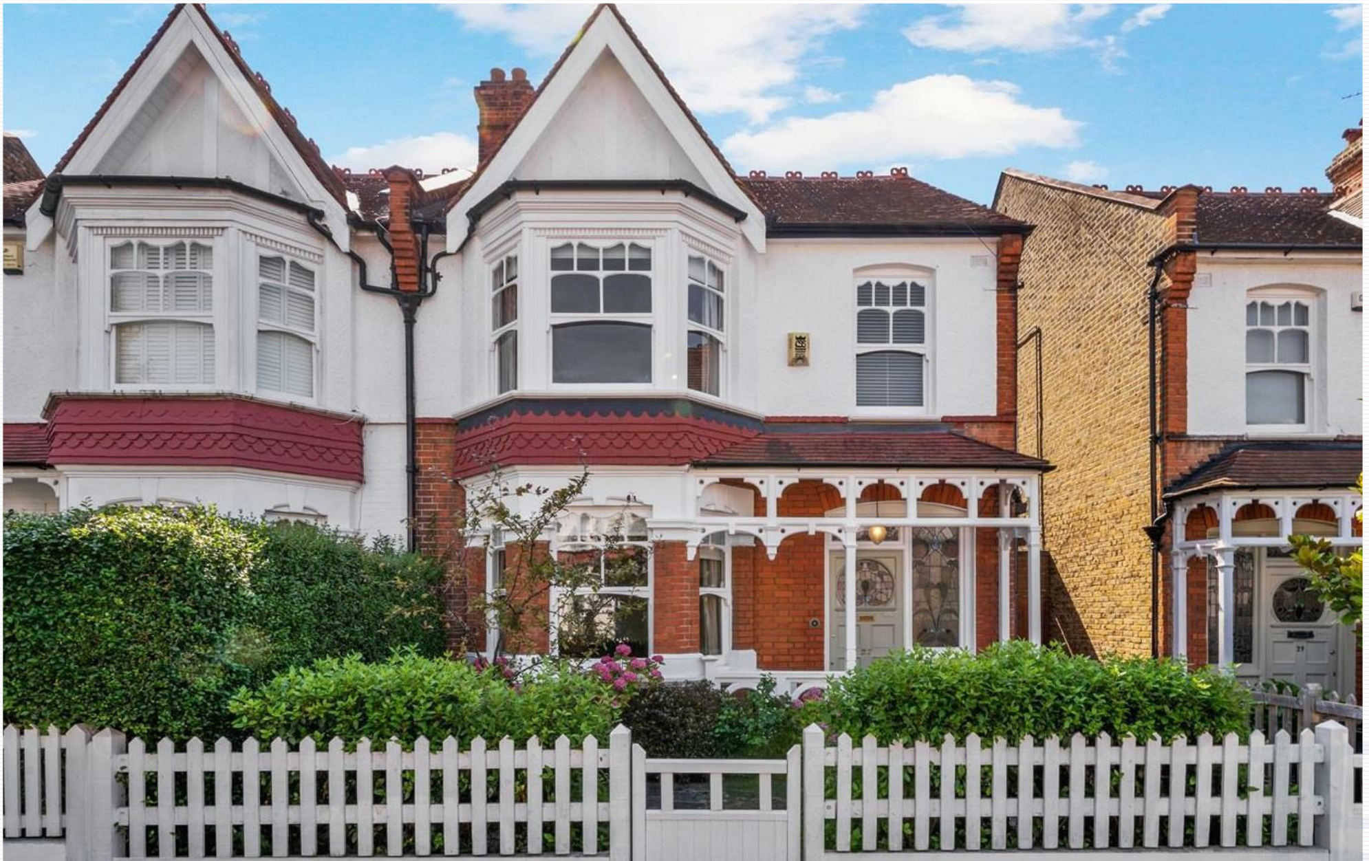
Dunmore Road, West Wimbledon, SW20 8TN