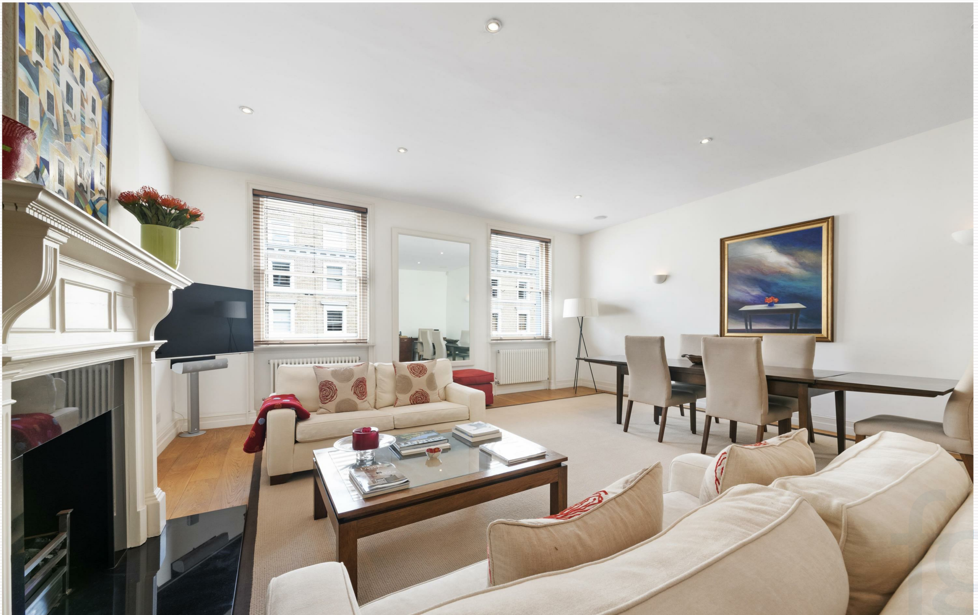
Elvaston Place, South Kensington, SW7 5NW