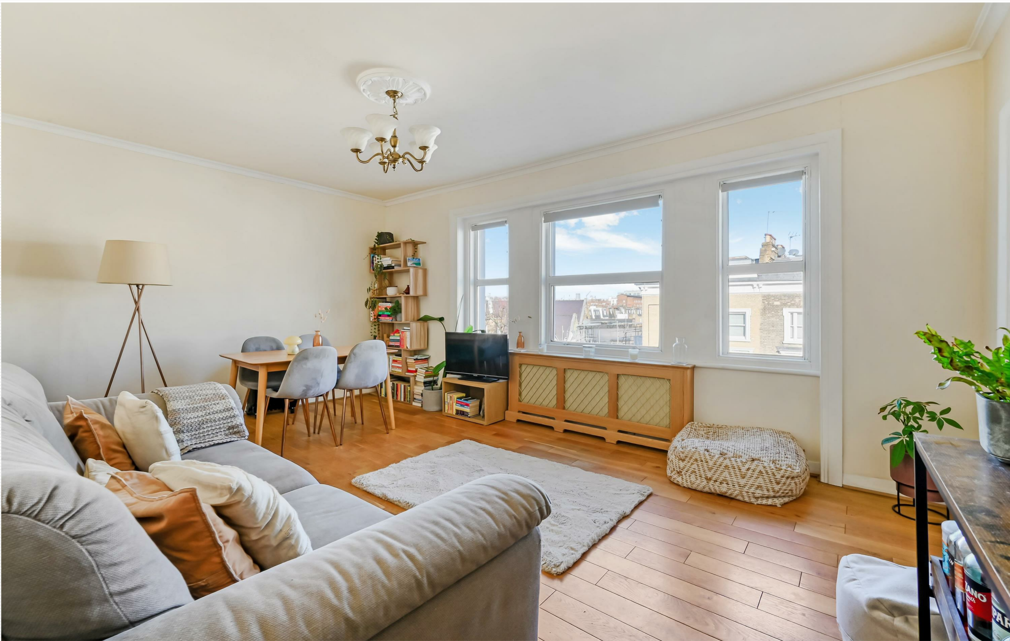
Lexham Gardens, South Kensington, W8 6JN