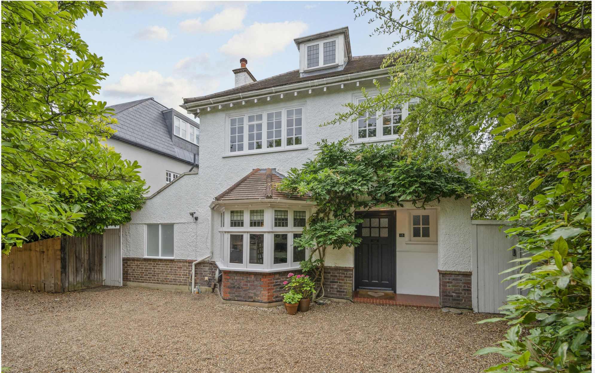
Montana Road, West Wimbledon, SW20 8TW