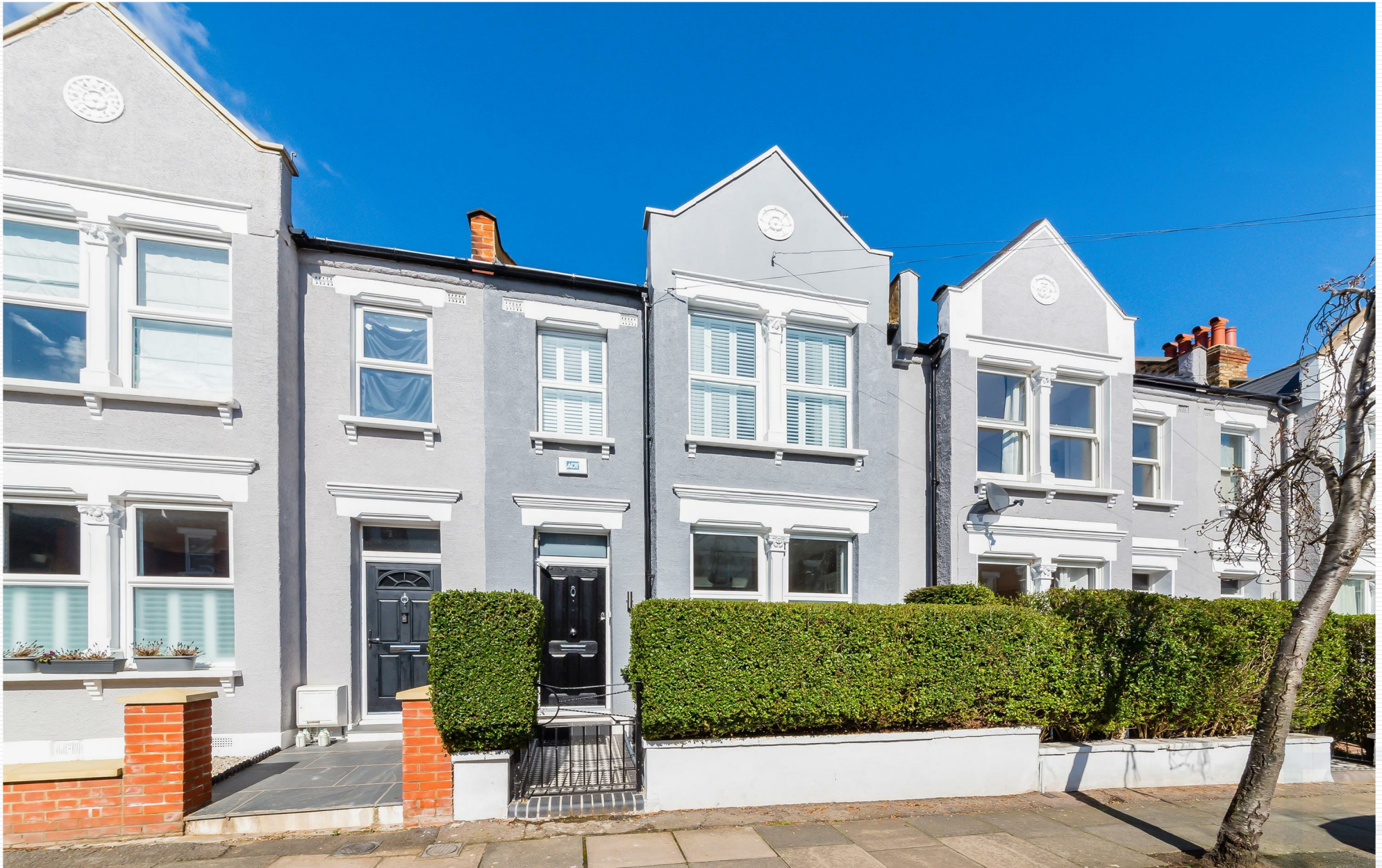
Haydon Park Road, Wimbledon, SW19 8JH