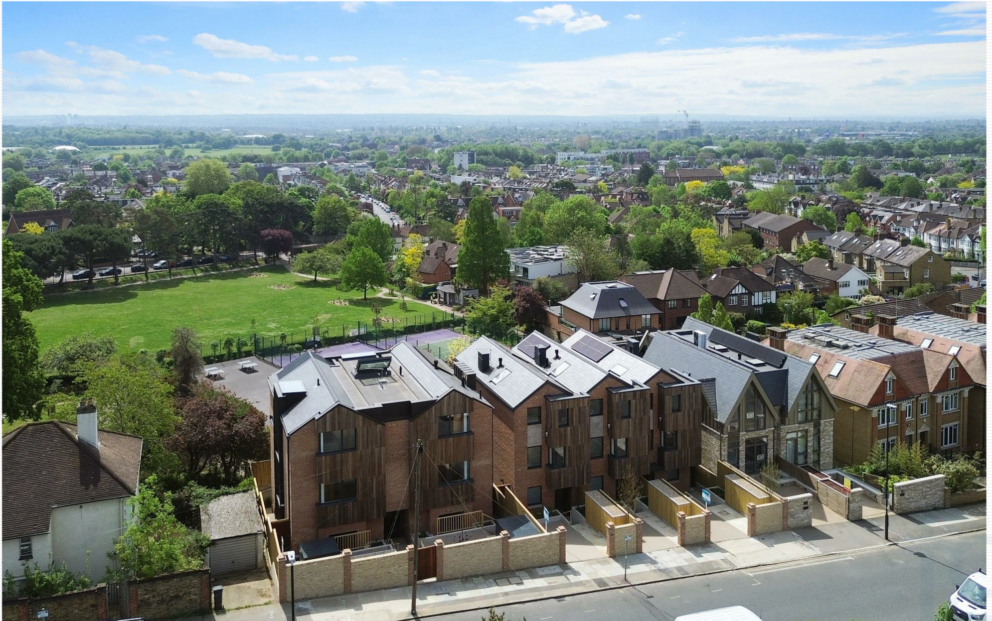
Cottenham Park Road, Wimbledon, SW20 0SB