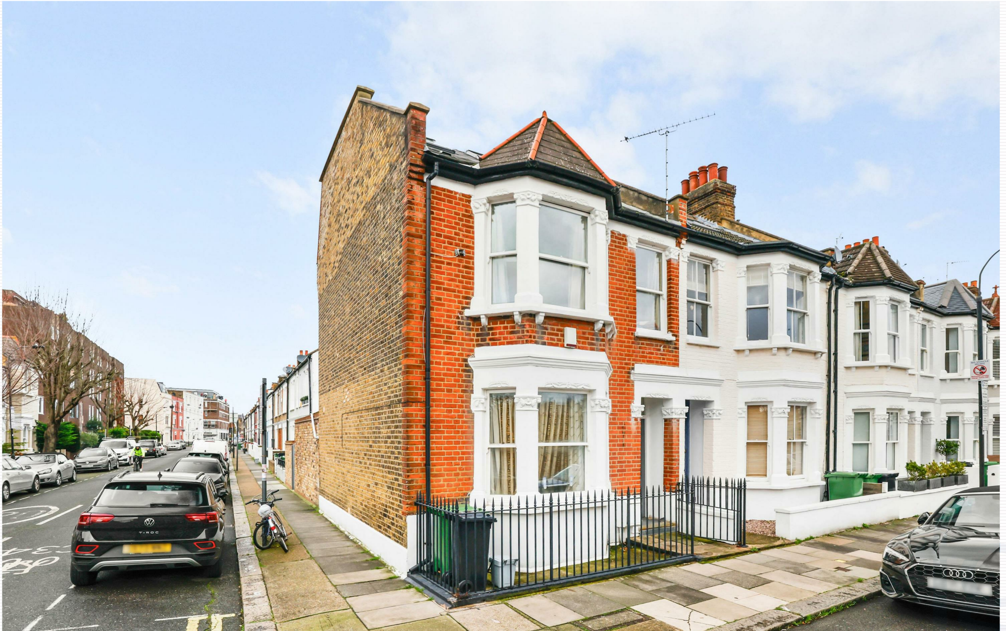
Lysia Street, Fulham, SW6 6NE