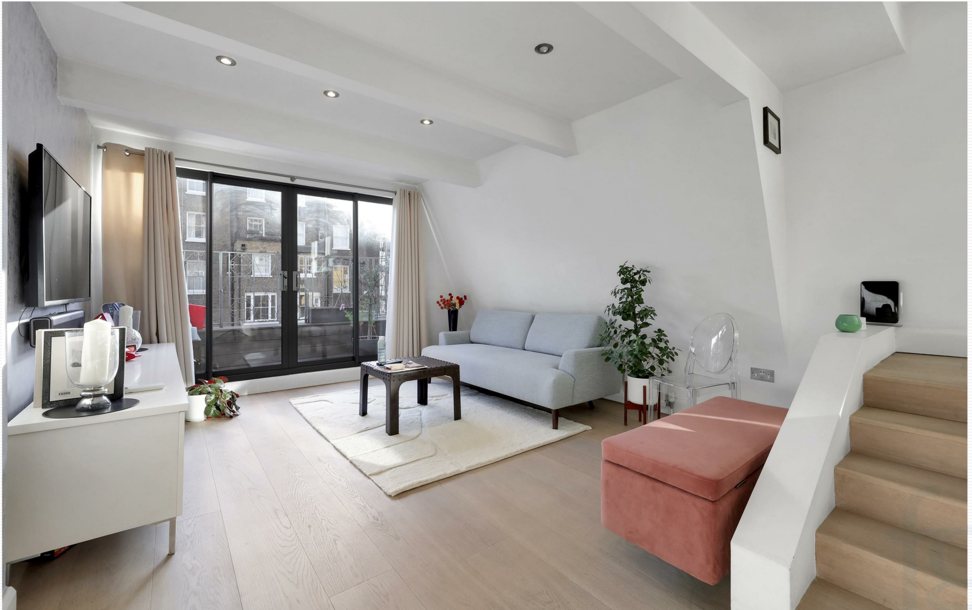
Cornwall Gardens, South Kensington, SW7 4AY

Guide Price £1,600,000 Share of Freehold