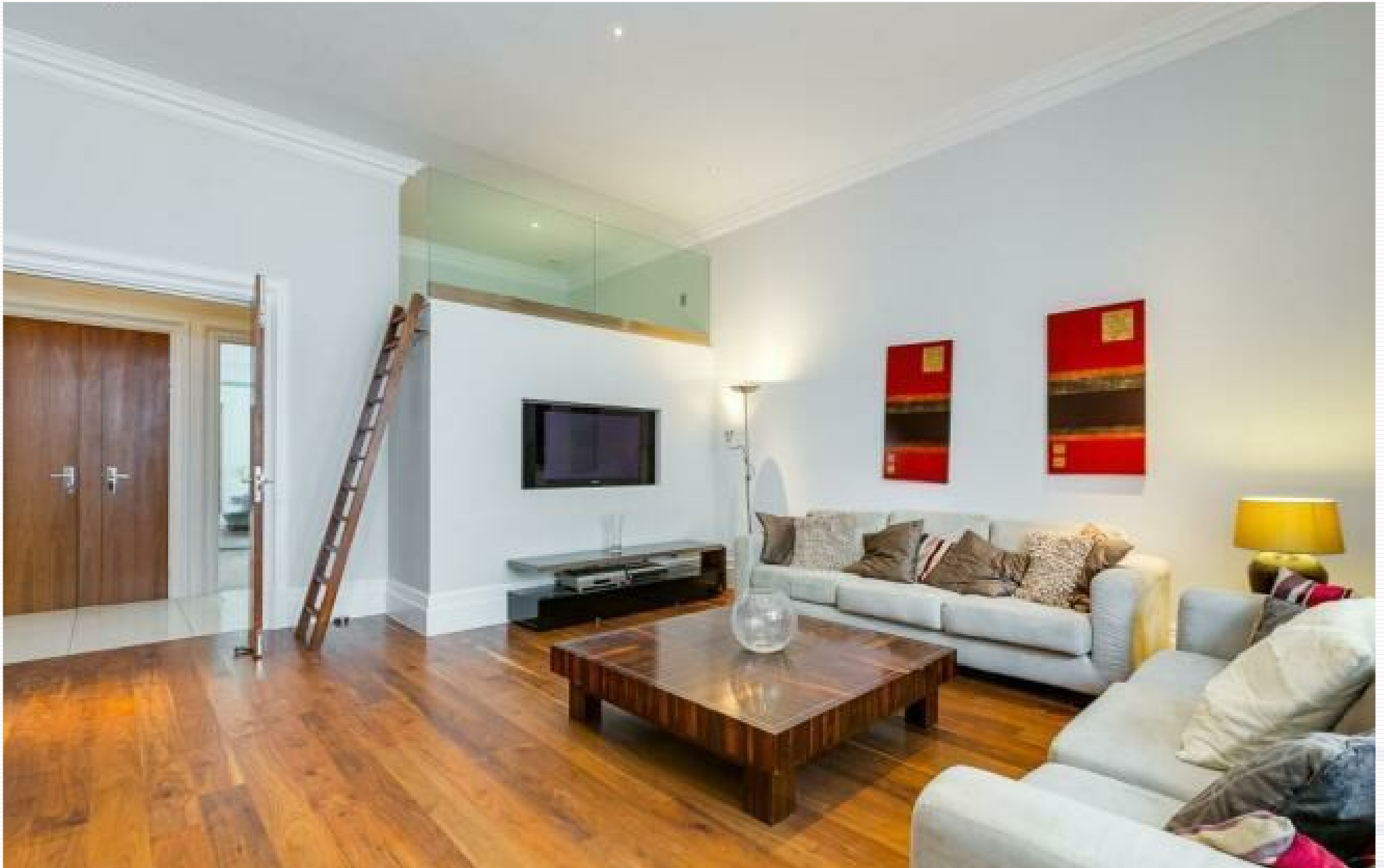
Queen's Gate Place, South Kensington, SW7 5NT