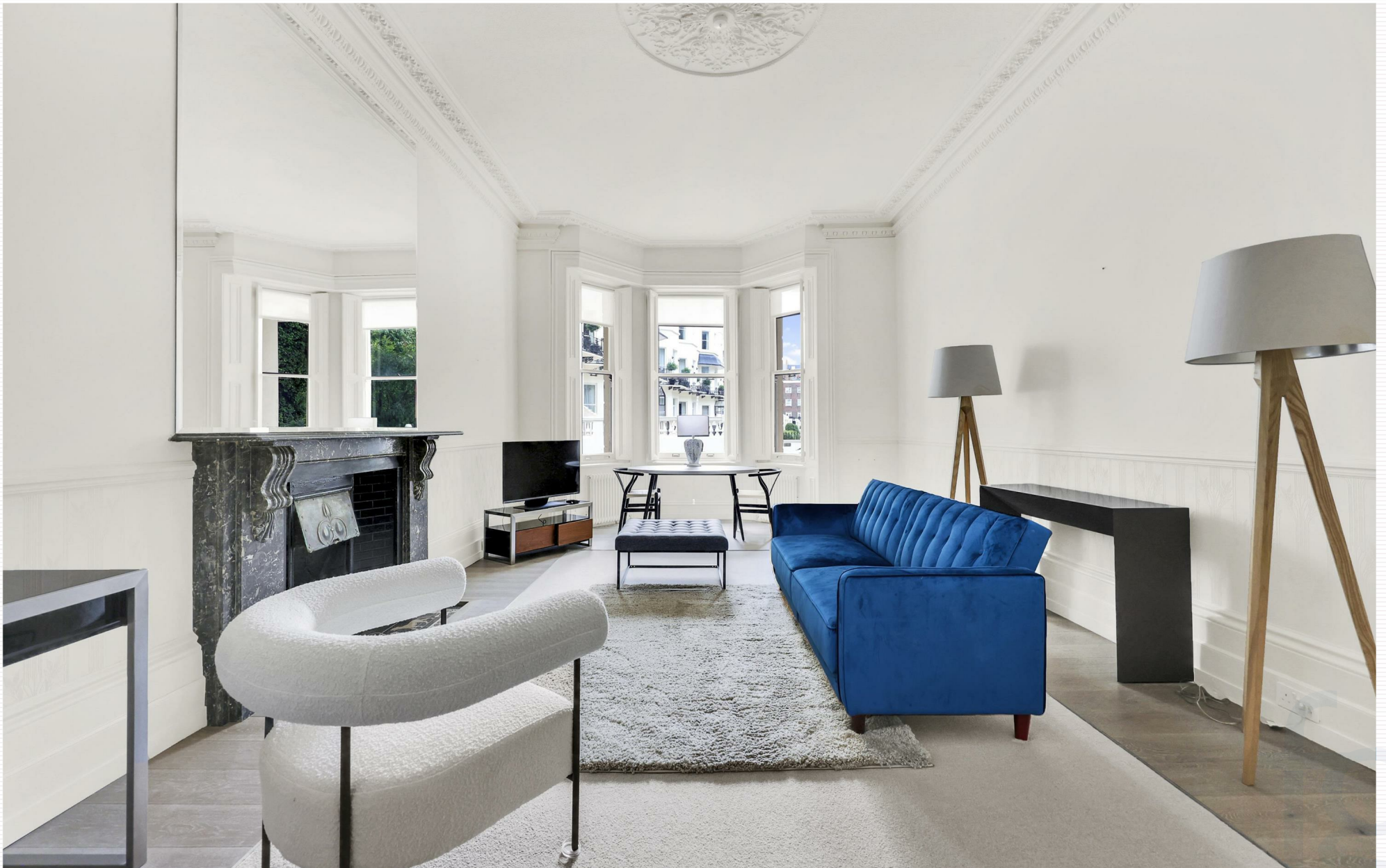
Stanhope Gardens, South Kensington, SW7 5RF