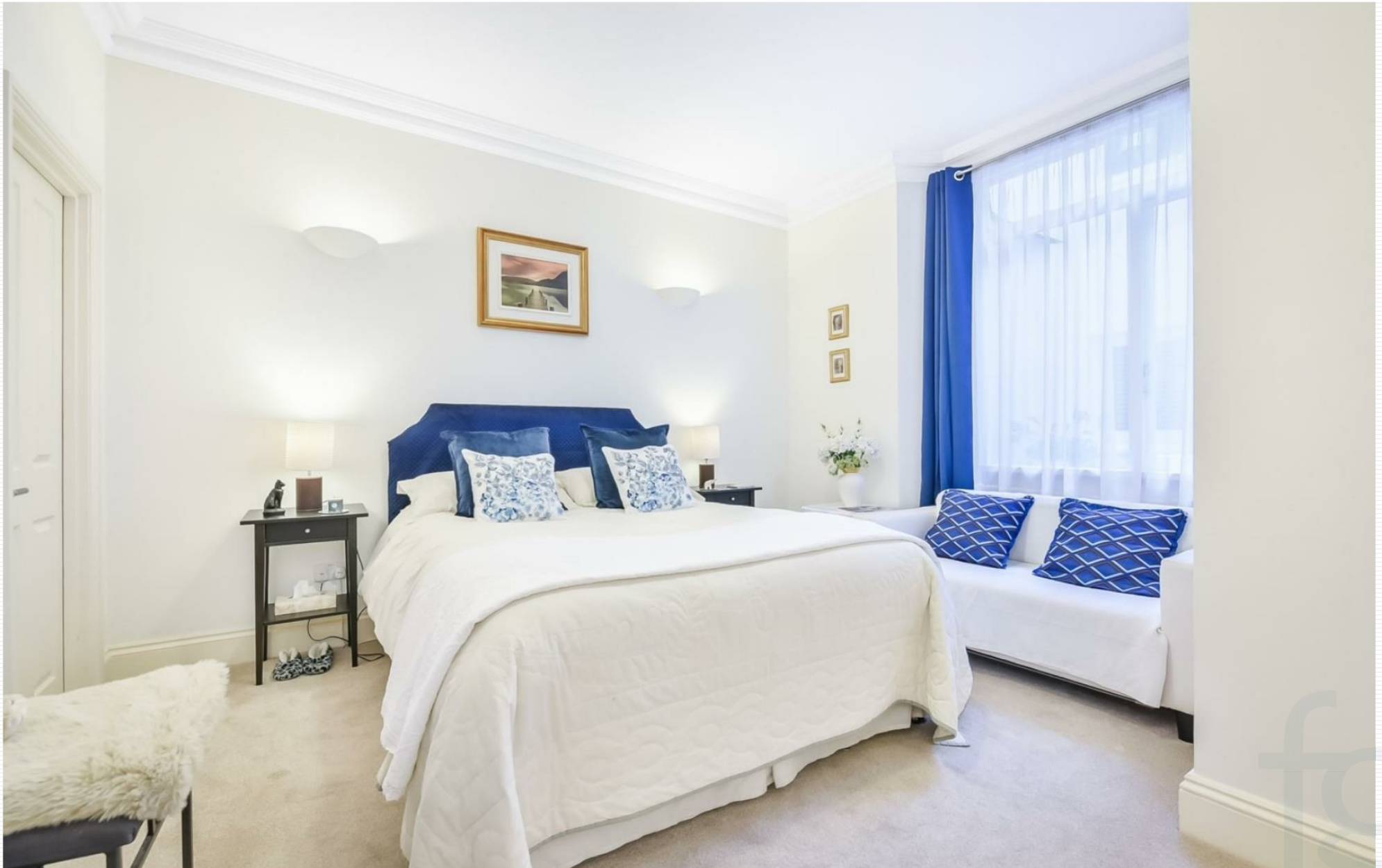
Queen's Gate Terrace, South Kensington, SW7 5PH

Guide Price £1,100,000 Share of Freehold