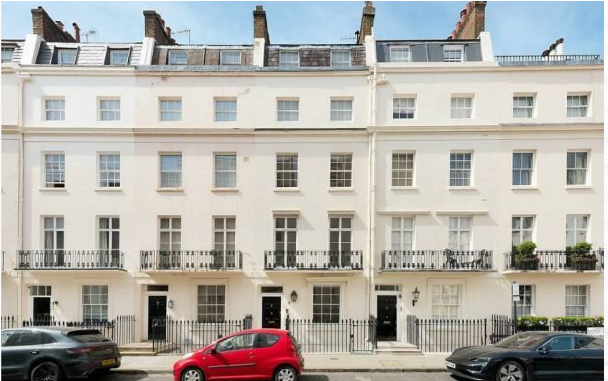
Eaton Terrace, Belgravia, SW1W 8EZ